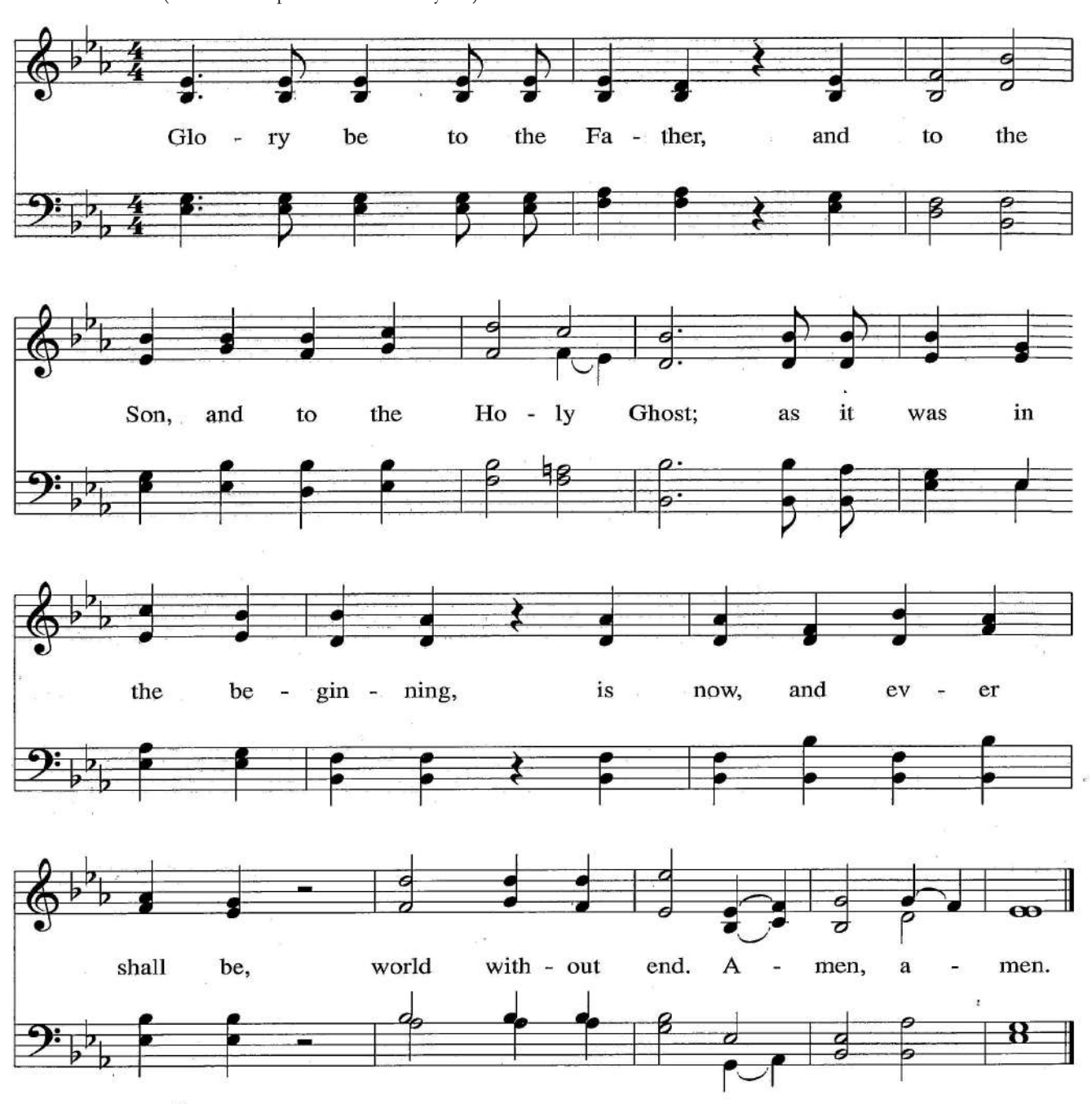
Gloria Patri (with hands upraised - 1 Timothy 2:8)

Pastor: The Gospel of Christ! People: Praise be to Christ!